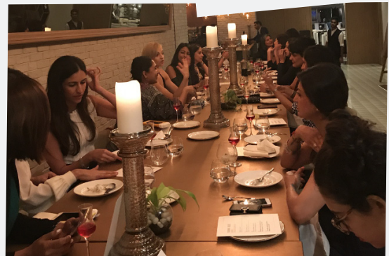
Guests tuck into the food at The A Club