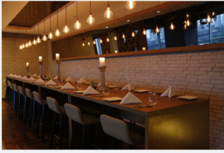
The setting at The A Club